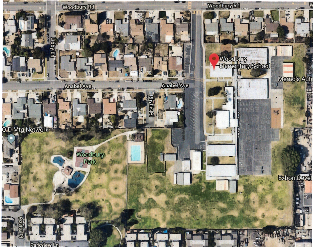
Existing site map