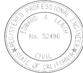
Civil Engineer's Stamp

52496 _____ RCE# 12/31/24 _____ Exp. Date