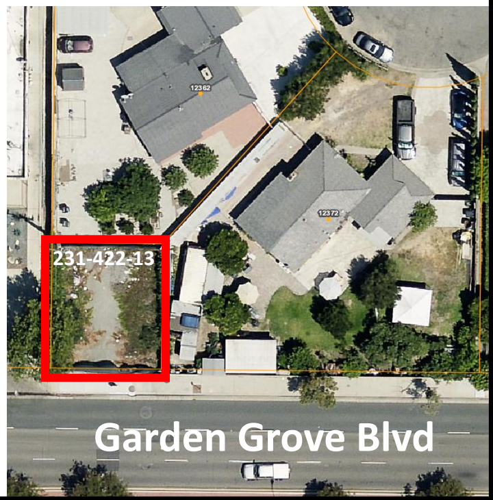
Garden Grove Blvd