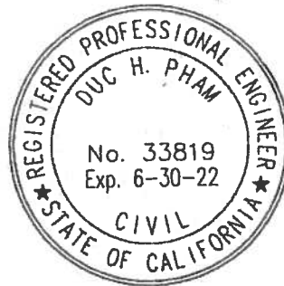
EXHIBIT "B" ATTACHED HERETO AND MADE A PART HEREOF. SUBJECT TO EASEMENTS COVENANTS, CONDITIONS, RESTRICTIONS, RESERVATIONS, RIGHTS, RIGHT-OF-WAYS, AND OTHER MATTERS EASEMENTS OF RECORD, IF ANY.

CONTAINING APPROXIMATELY 1,250.00 SQUARE FEET.